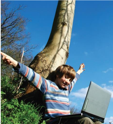
Smiling young boy with arms raised in celebration